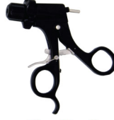
Fibre Handle Middle Ratchet PART NO.: FHMR-02