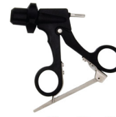
Fibre Handle Bottom Ratchet PART NO.: FHBR-03