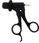
Fibre Handle Plain PART NO.: FHP-01