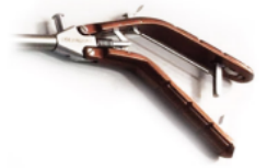
Pistol Handle Ratchet