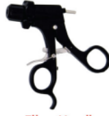
Fibre Handle Middle Ratchet PART NO.: FHMR-02