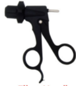
Fibre Handle Plain PART NO.: FHP-01