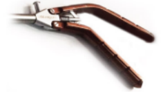
Pistol Handle Plain