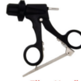
Fibre Handle Bottom Ratchet PART NO.: FHBR-03